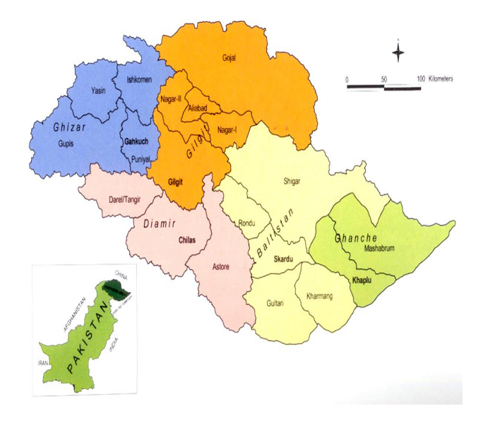
Fig.1. Map of Gilgit-Baltistan

Sheep are the major source of revenue for over a million livestock farmers in Pakistan as it fits better other livestock to environmental than and socioeconomic circumstances (Khan et al., 2007). Goat and sheep are multipurpose animals which provide hair, wool, meat and milk, goat and sheep meat is the major source of animal protein for the people of our country (Nasrullah et al., 2013). The population of sheep in Pakistan is about 27.8 million (Economic Survey of Pakistan 2009-10) and the annual contribution of wool in livestock products is 42 thousand tons. However, an estimated increase of 41% in sheep population in the last 20 years has not proportionally corresponded with increased productivity. The major factors being lack of selective breeding for improvement, and poor management, nutrition and disease control (Qureshi and Ghaffar, 2002).